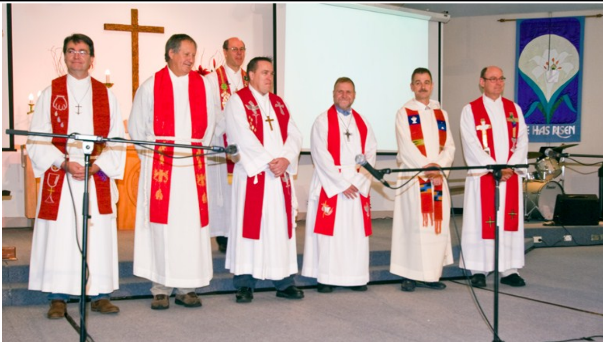
Welcoming new pastors to the District.